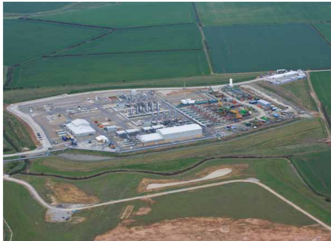
Aerial photo of the site taken in April 2011

SSE and Statoil became owners of the two projects in 2002 and 2003. The two companies combined the projects in late 2003. Site work commenced in March 2004 and leaching of the first cavern started in March 2005.