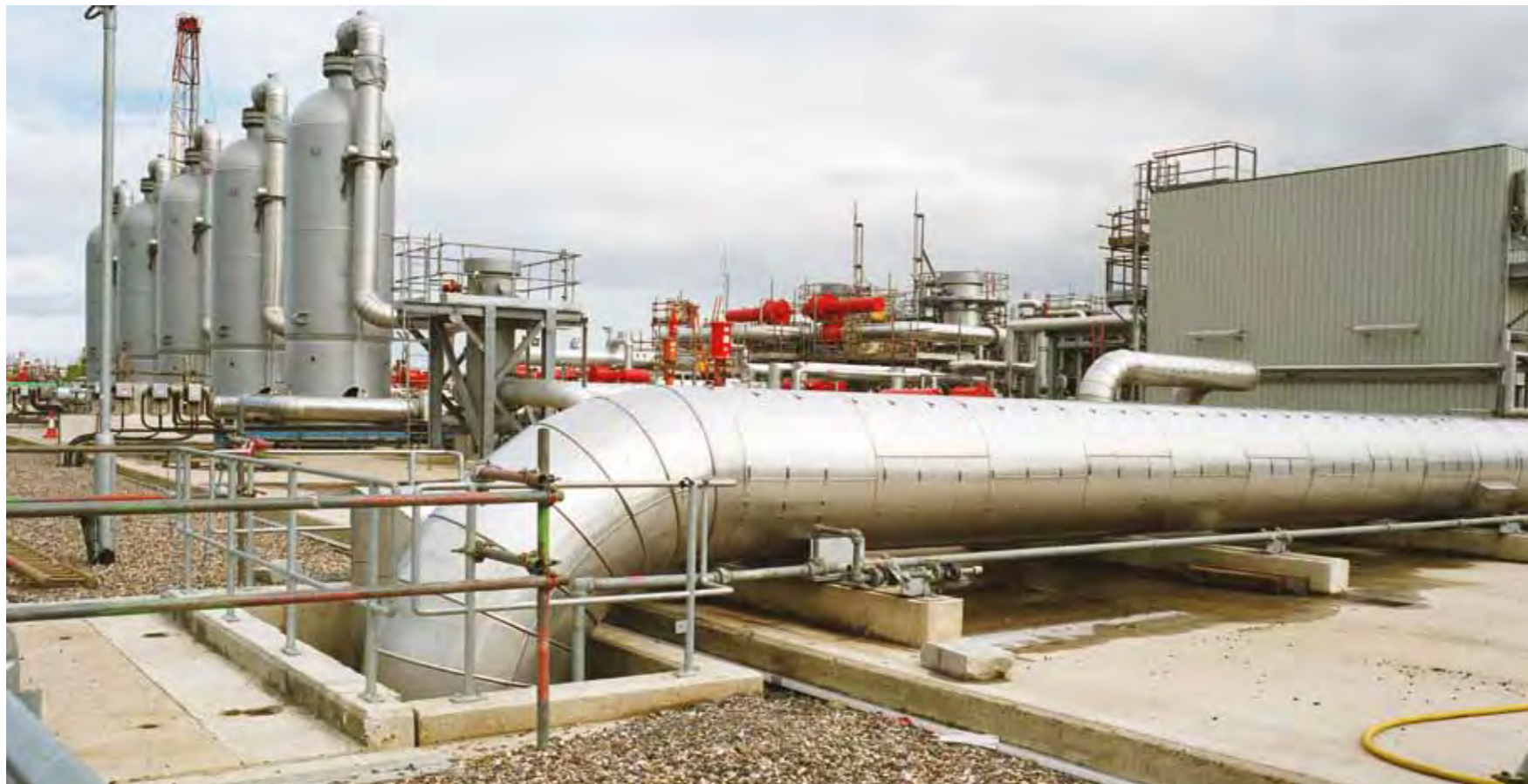
On site at Aldbrough Phase One

In this instance the Agreement will include bridleway diversion to the existing S106 – we have set out our proposals for this on the next board.