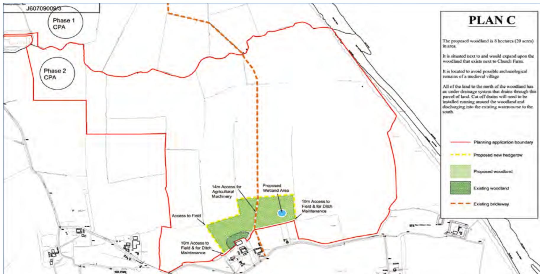
Woodland planting plan

We have aimed to accommodate the views of individual residents as far as possible, but it is important to remember that the Scheme will be for the benefit of the whole community. Please do let us know your views.