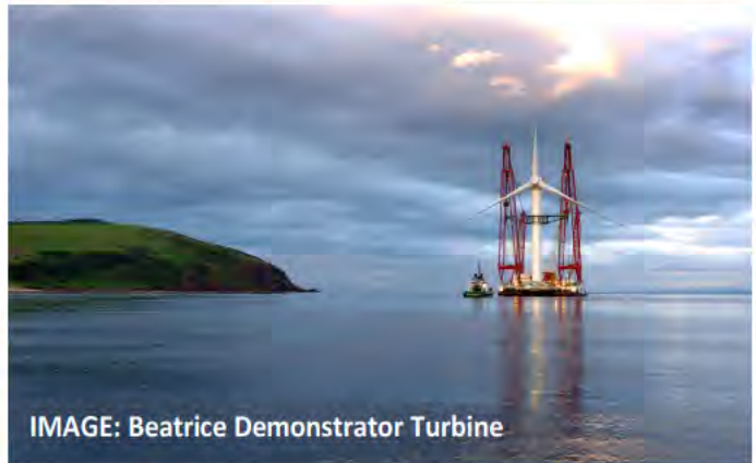
IMAGE: Beatrice Demonstrator Turbine

BOWL is proud to sponsor Caithness Horizon's "Beatrice Works!" education programme with local schools; exploring renewables through art, engineering and technology. The education programme for Primary and Secondary schools surrounding Caithness aims to explore how current developments in renewable technology are making an impact locally, nationally and internationally. www.caithnesshorizons.co.uk