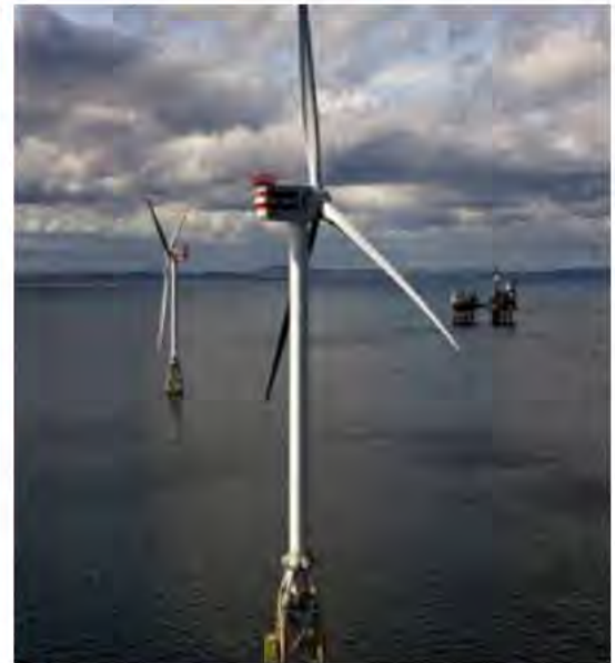
IMAGE: Beatrice Demonstrator Turbines

In April 2012, we submitted an application to the Scottish Government for consent to develop all the offshore elements of the Project. Since submission, consultation responses have been received from statutory and non-statutory consultees and there have been advancements in assessment methods for some of the environmental receptors. As such, BOWL has submitted an Addendum to the Environmental Statement to ensure further information as a result of this is incorporated in the Environmental Impact Assessment for the Project. The amendments to the original application, as submitted through the Environmental Statement Addendum, are minor with no changes being made to the original layout of the scheme.