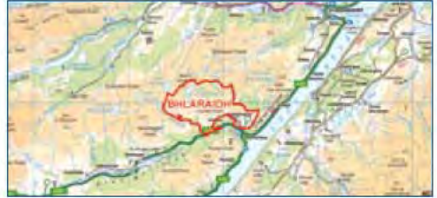
Red line site boundary

The proposed site area, shown below, is owned by Glenmoriston Estate. It is located on a relatively remote plateau which is approximately 4km to the northwest of the village of Invermoriston. The wind farm has been designed to eliminate any views from the major tourist attractions around the shores of Loch Ness and the Great Glen. Bhlaraidh is situated in Highland Council's 'Broad Area of Search' for wind farms.